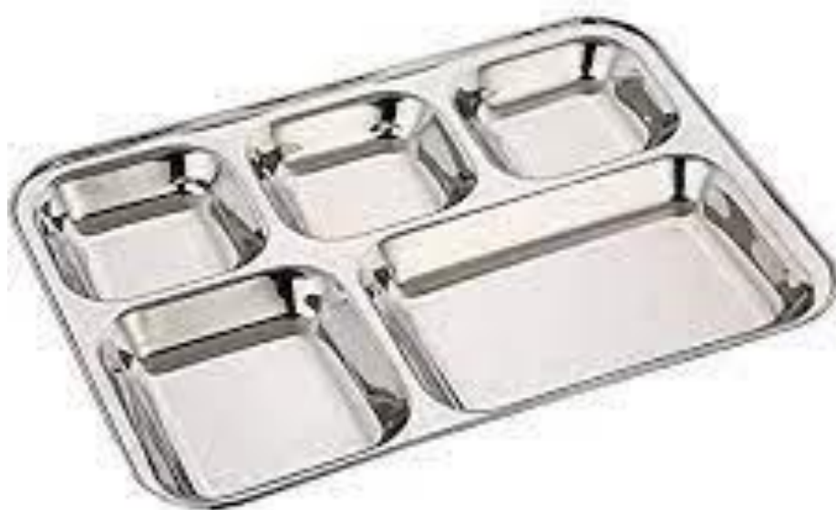
Diagram of Item No. 1 & Each container should be 1 inch deep (Dining Thatu)